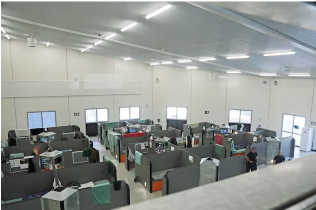
An aerial view of a rapid-build prison wing.

19. Please comment on the increased risk of infection and issues that will arise regarding those prisoners who are housed in “rapid build” dorm style accommodation? Inmates are held in 25 bed open-plan dorm living spaces with small barriers lower than shoulder height dividing their personal areas (in Rapid-Build Prisons). These prisons were designed for inmates to be out of the living area for 12 hours per day while in programmes. If these inmates are locked in for extended periods of time during the COVID-19 pandemic period, are they at a higher risk of contracting COVID-19 than the general prison population? Example picture of “rapid build” dorm style accommodation: