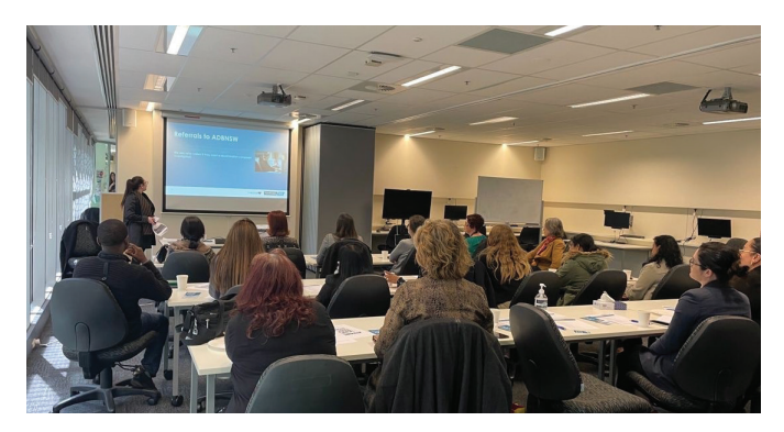
Anti-Discrimination NSW at LawAccess NSW

This year also brought an exciting collaboration with the Department of Communities and Justice Aboriginal Service Branch to promote the launch of the Know Your Conditions campaign for Aboriginal and Torres Strait Islander people.