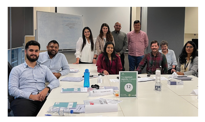
New starters at induction.