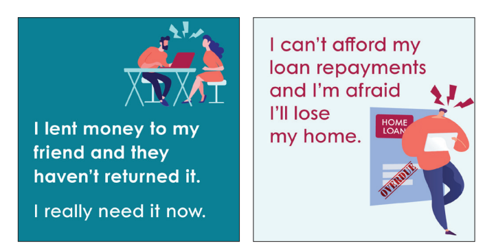
Debt and Consumer social media campaign

recruitment video to showcase what it is like to work as an information officer. A social media campaign promoting the video ran for 2 weeks and reached over 17,000 people on Facebook.